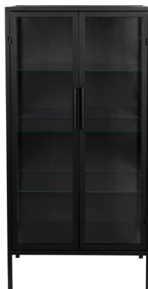
ROB CABINET M