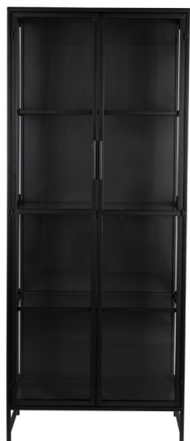
ROB CABINET L